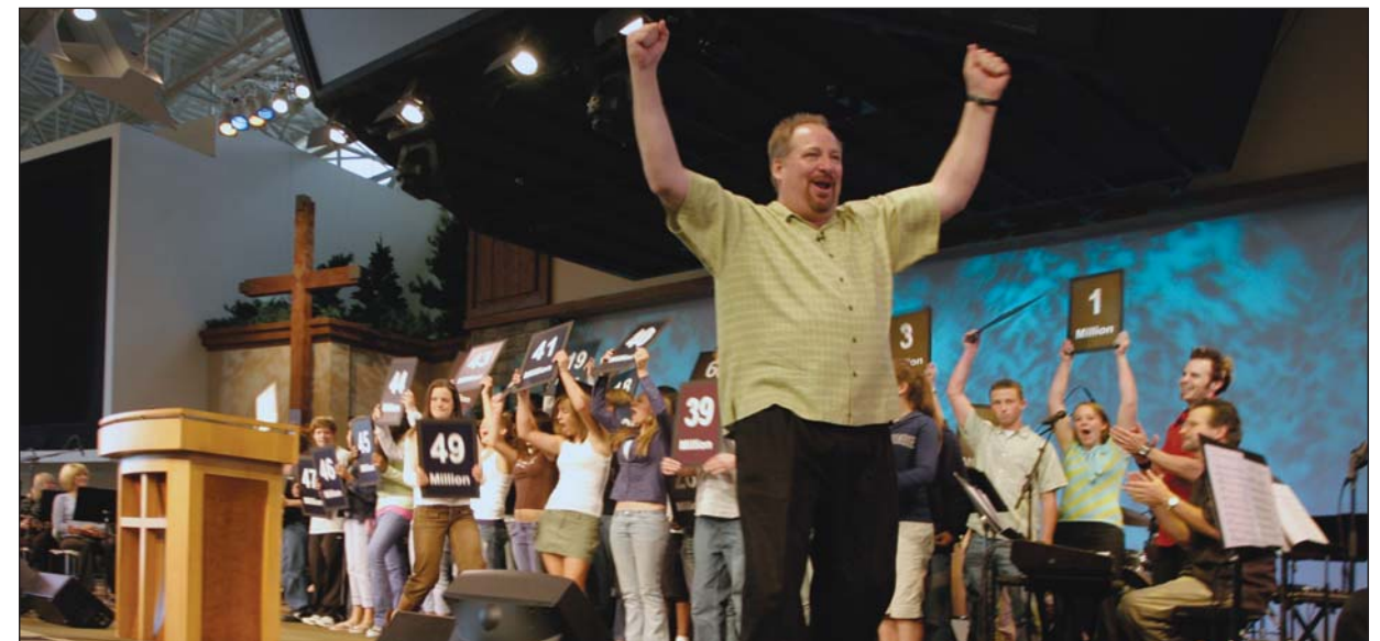
Celebration Weekend - $50 Million Given and Pledged

Our best days are ahead of us. So hang on for the ride of your life!